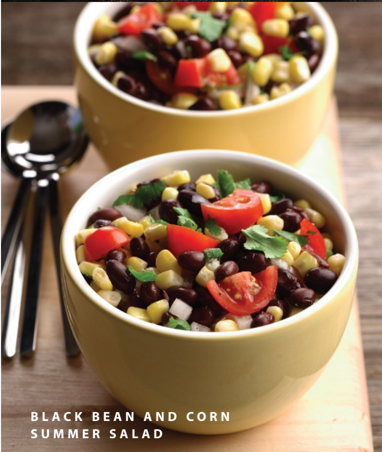
BLACK BEAN AND CORN SUMMER SALAD