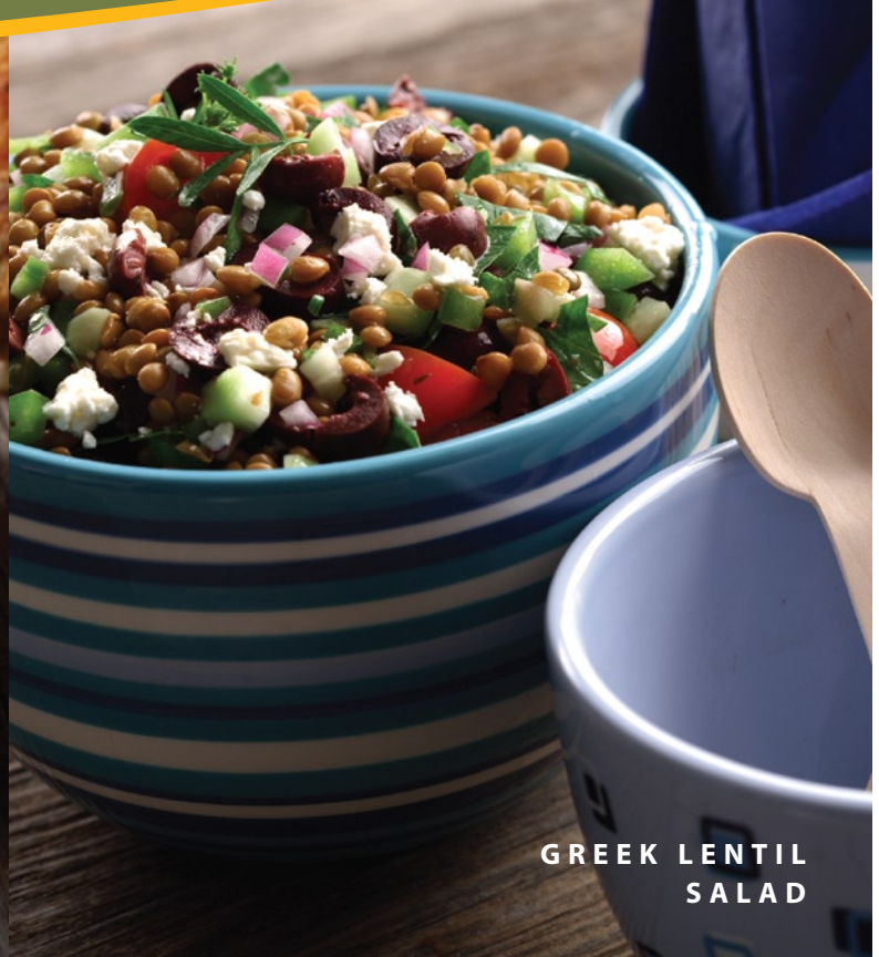
GREEK LENTIL SALAD