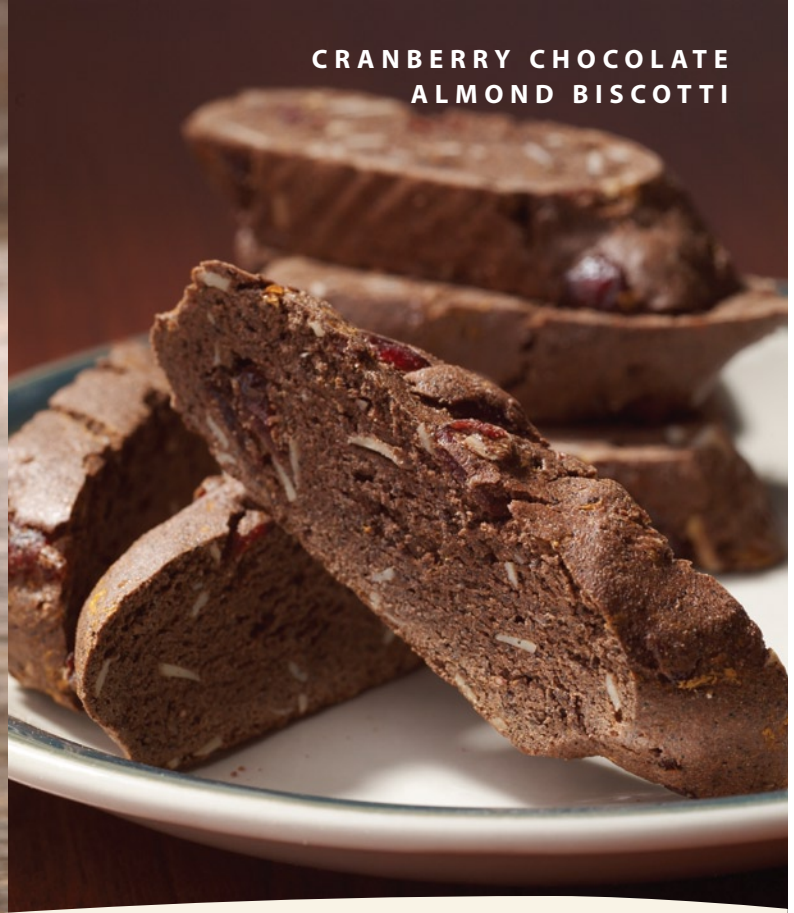
CRANBERRY CHOCOLATE ALMOND BISCOTTI