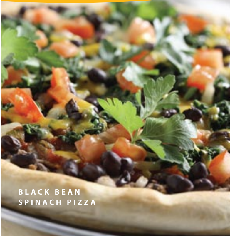
BLACK BEAN SPINACH PIZZA