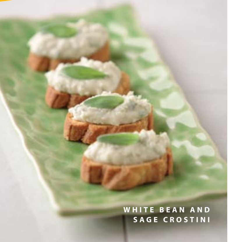
WHITE BEAN AND SAGE CROSTINI